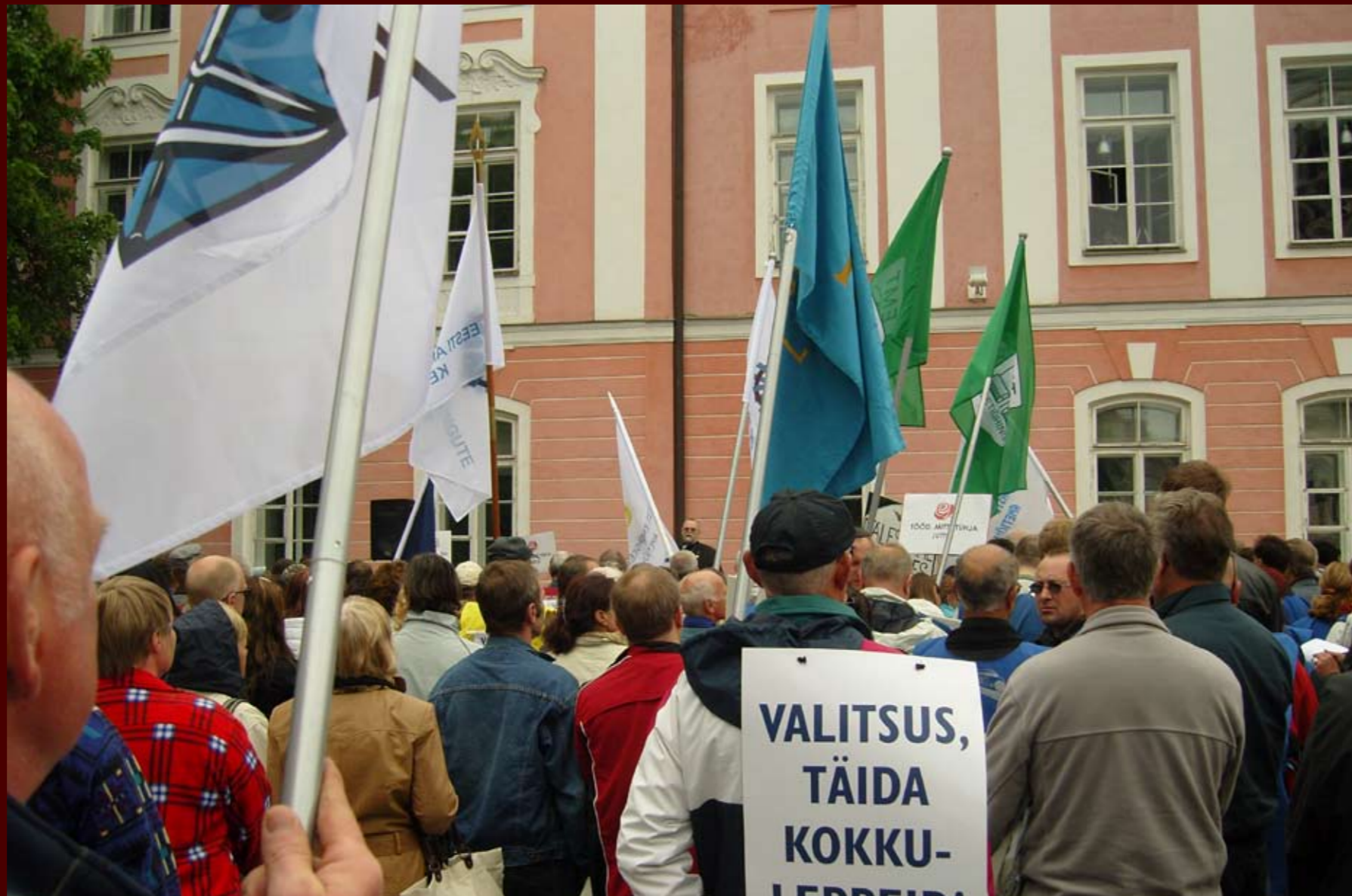
10. "GOVERNMENT SHOULD COMPLY WITH AGREEMENTS" BANNER, ESTONIA

The Government of Estonia revised the Employment Contracts Act in 2009 but after an initial tripartite agreement and a change in the employment situation due to the economic crisis, the Estonian Government introduced changes unilaterally to the text. Workers and trade unions clearly feel that the new agreement does not provide them with the security they need, in terms of compensation or training, and therefore does not provide conditions for decent work.