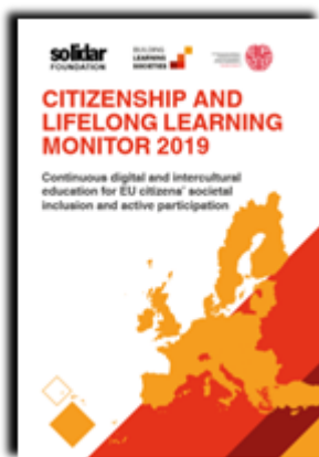
Example of Monitor from SOLIDAR Foundation.

Also, together with the designers, we have developed infographics and charts which aid in conveying main messages and make the reports more attractive to readers, helping them focus attention.