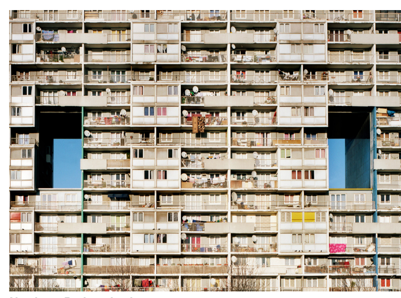
Northern Paris suburb

Though this approach is positive, and it certainly yields examples of essential work performed by CSOs on the ground, it has many deficiencies in the way it is implemented. The anecdotal evidence cannot cover the implications of structural issues. As the work of ANCT should advance in the framework of the 2017 report 'Live together, live big. For a national reconciliation', which recommended '48 measures