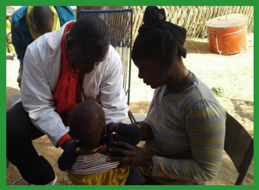
Consultation of children by the health worker of the CSCom de Santié, as part of FARN activities

So far, the MPDL Mali has set up more than 50 FARNs which have cured more than 1000 children of their state of malnutrition.